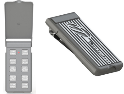
New Multi-Function Remote Included