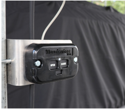
Compatible with the EZ Cover remote and keypad system.